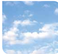
Low maintenance glass

How does it work? There are two processes. Firstly, the special coating harnesses the natural daylight which triggers the breakdown of the dirt and grime on the outside of the glass and secondly, when the rainwater hits the glass, rather than forming droplets,