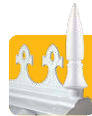
Global finial & Global cresting

The interlocking PVC-U sections of the crestings incorporate an interlock that ensures once connected they remain in a perfect line. There are decorative finial designs to suit every home and these are available in suited colours.