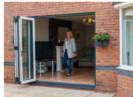
The Imagine Bi-Fold Door makes an attractive alternative to a traditional sliding patio door; completely opening your home up to the garden or patio.